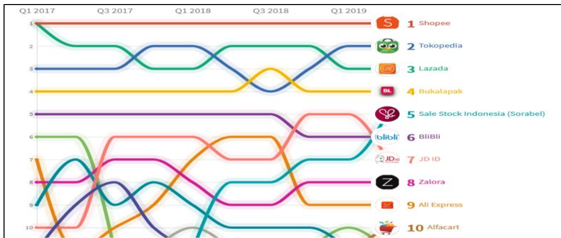
Table 1. Top E-Commerce based on PlayStore Ranking Q1 2017-Quarter II 2019

Shop as an e-commerce offering various products ranging from those that are always sought after, namely clothing, electronic clothing, household items, bags, hobbies and collections, food and beverages, children's needs, cosmetics, traditional goods, and many others. If a shop can read the factors that can affect impulse buying from consumers, shops will continue to be in the first position of the e-commerce company line. Shopee offers lots of discount vouchers to lower prices if you buy a certain amount of goods from registered stores and Shopee itself.